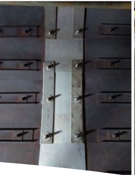
Field relining of exhaust diffuser joint.