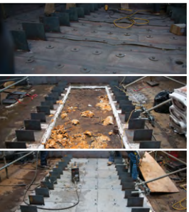
FS7F silencer floor repair.