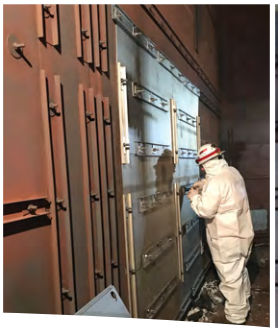
Proper torquing of the exhaust liner hardware.